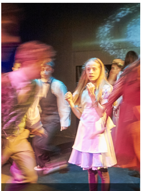
Alice falling down the rabbit hole in "Alice and the Black Hole Blues"